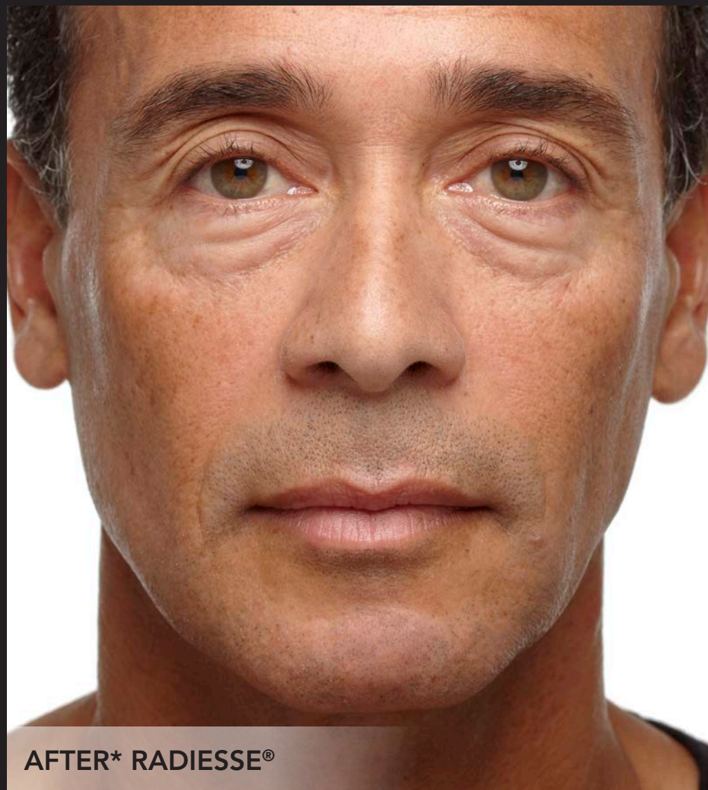
AFTER* RADIESSE ®